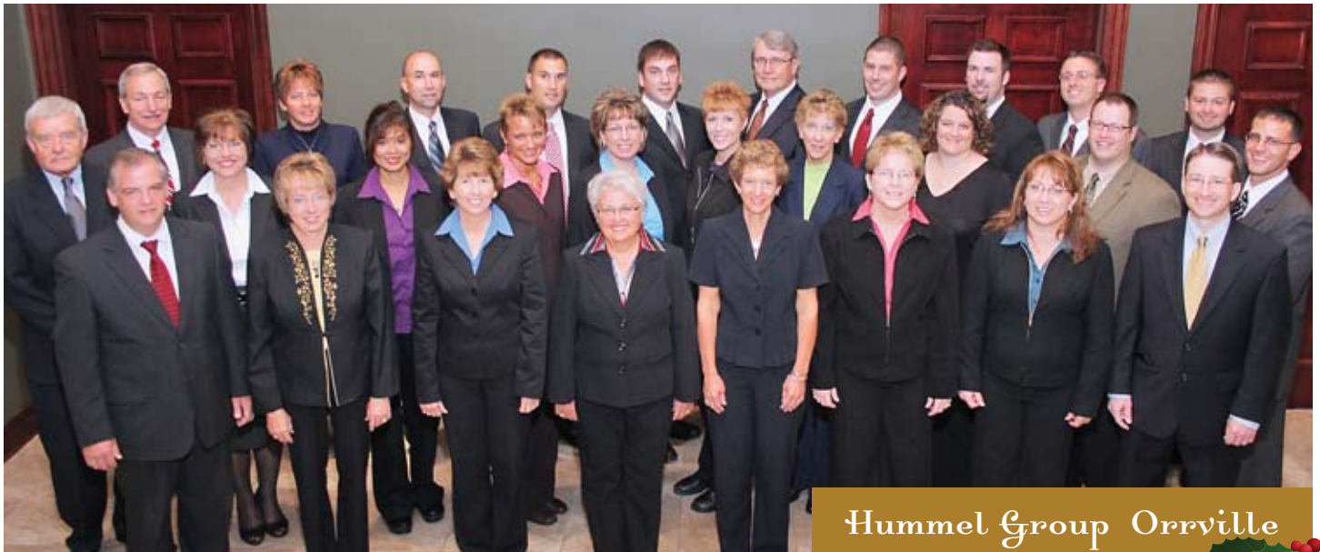
Hummel Group Orrville