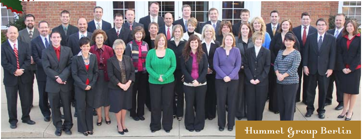
Hummel Group Berlin