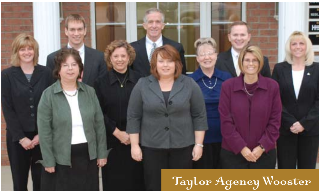
Taylor Agency Wooster